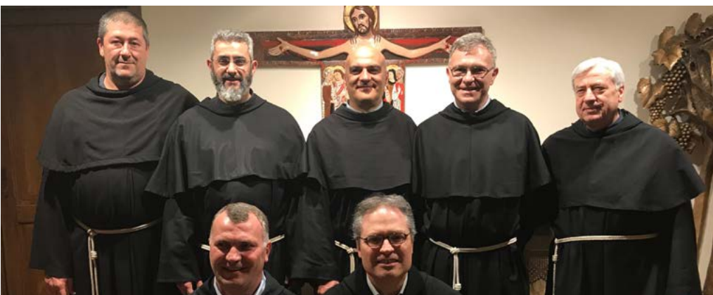
The Provincial Definitory