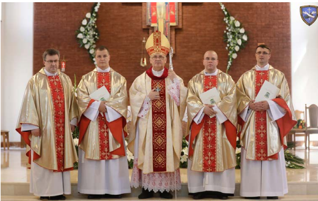
The newly ordained priests with the bishop

At the end, the Minister Provincial of Gdańsk encouraged the new priests to let themselves be truly filled with the Holy Spirit and to always be at the service of those to whom they will be sent, sharing what they have received.