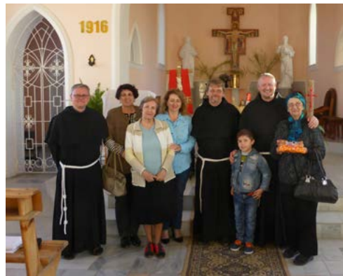
In Bukhara / in Samarkand