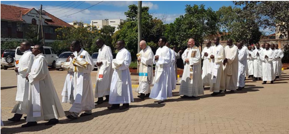
The entrance procession