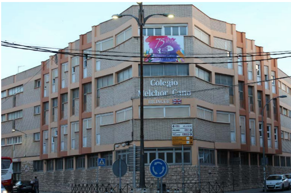
"Colegio Melchor Cano"