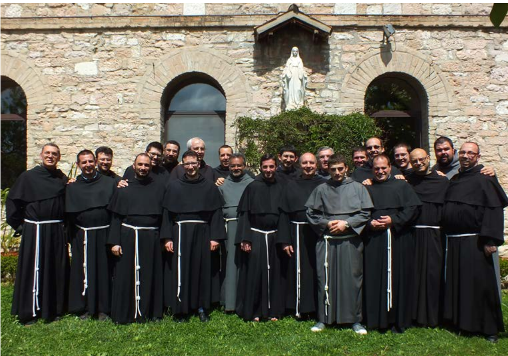
The friars of the post-novitiate

Finally, there was also some time for discussion with the formators and personal interviews for those friars who wanted them.