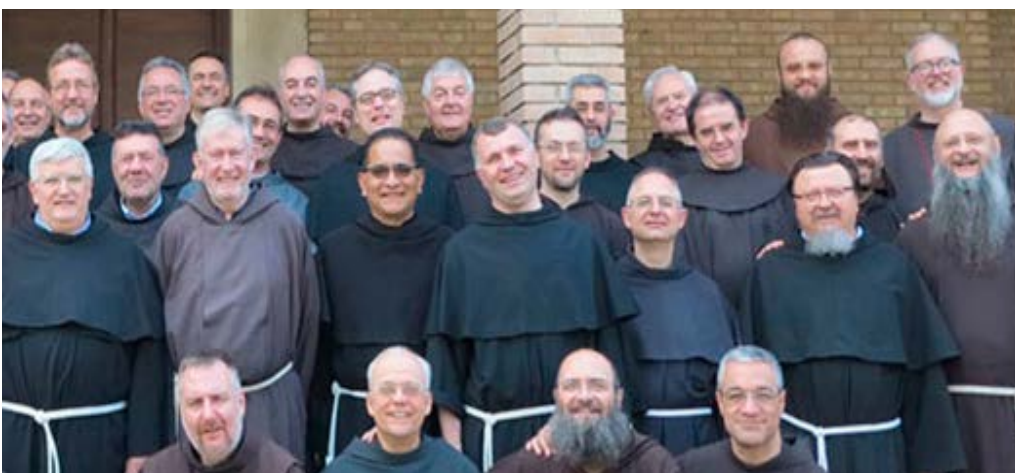
The participants (partial)