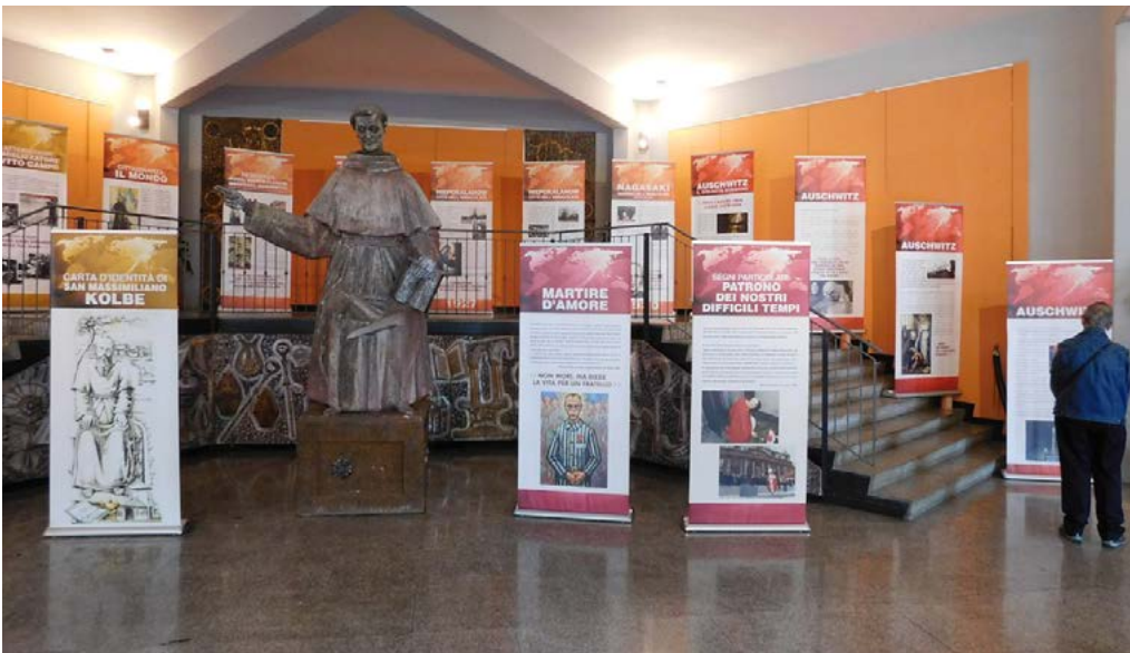
Display on St. Maximilian at the entrance of the Seraphicum