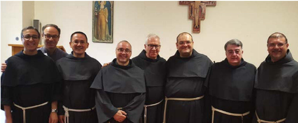
The Minister Provincial and some guardians