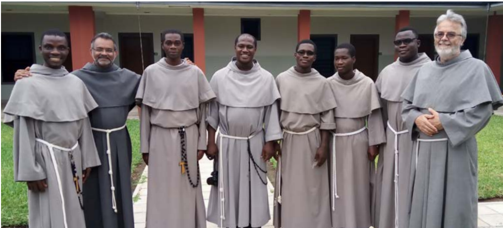
with the novices

The visit to Ghana was an opportunity to experience the warm welcome of the friars and the people and to understand the work our friars are doing.