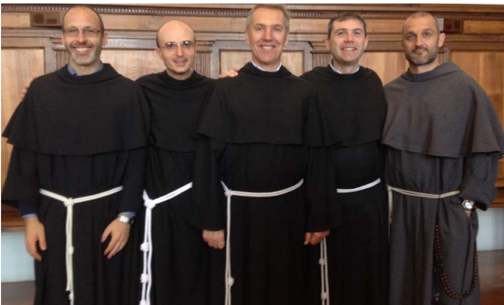
The members of the committee

The committee worked for two days to create a first draft of the program for the Meeting and to define the most important issues needing attention. It was decided that this planning session would start in Assisi and end in Rome. Each member was given the task of drafting the topic that was entrusted to him. Those drafts will be evaluated at the next planning session of the committee which is scheduled for the end of this year.