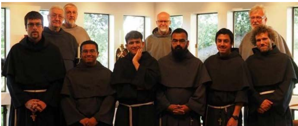
With the friars in Arroyo Grande