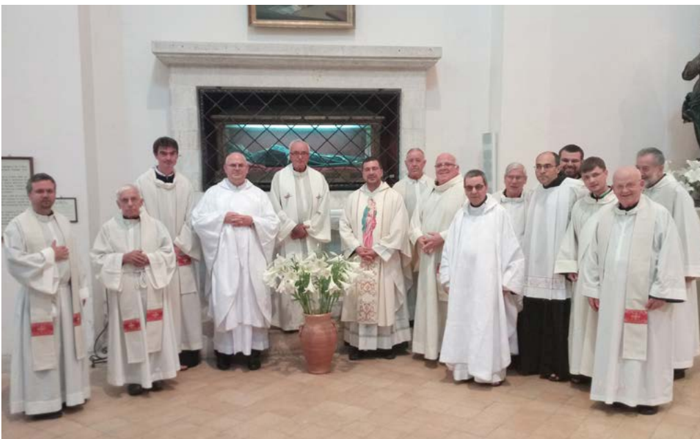
The participants in front of the tomb of Friar Thomas of Celano

The meeting concluded with the celebration of Mass in the church which enshrines the mortal remains of this great confrere and first biographer of St. Francis.