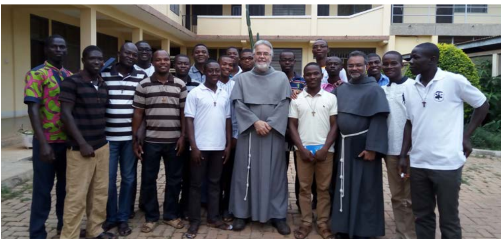
with the postulants