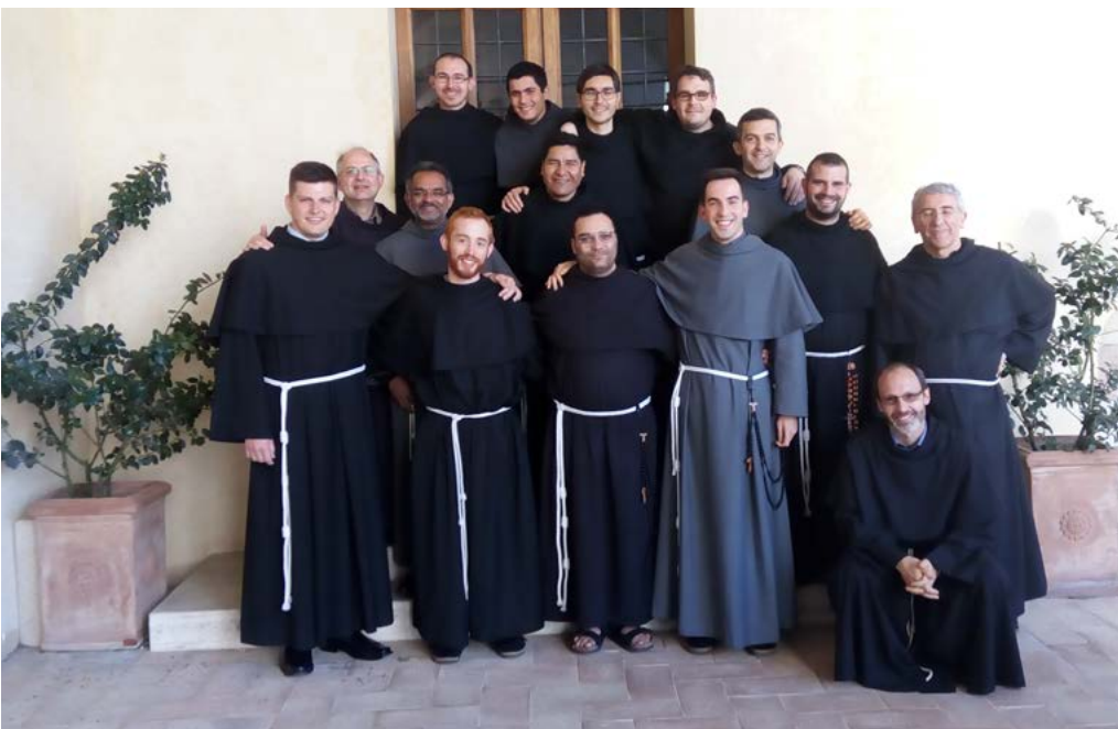
The friars of the novitiate