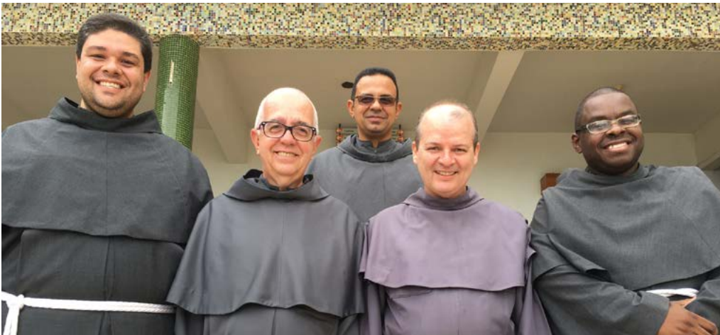
The Custodial Definitory