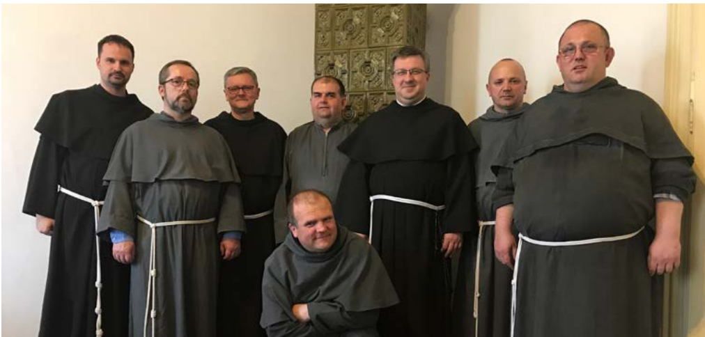
With the friars of the Province

During the meeting the members discussed the topics related to the future transformation of the Province of Hungary/Transylvania into a Provincial Delegation of the Polish Province of St. Maximilian M. Kolbe. The next meeting on this topic is scheduled for this coming fall.