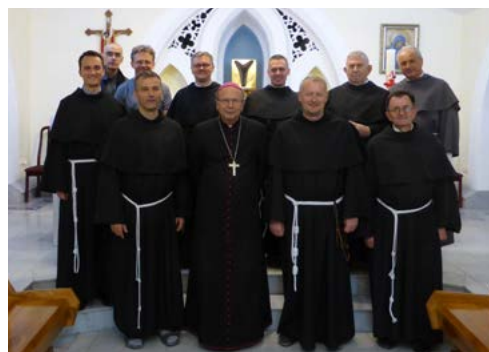
In Urgench / friars of the Delegation