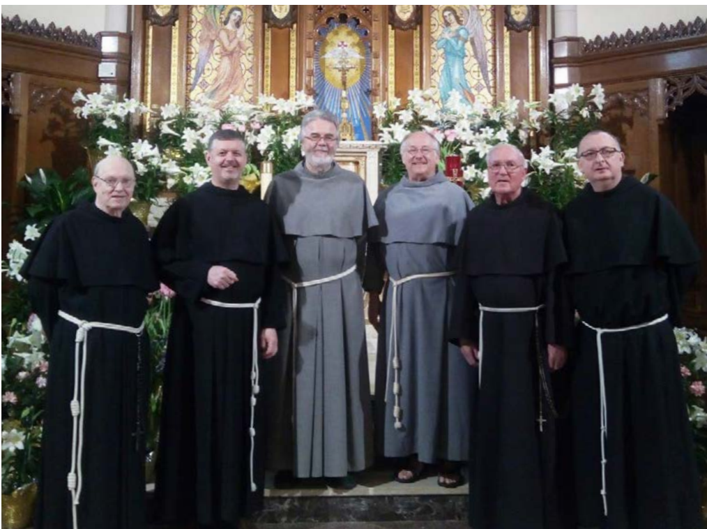
With the friars in Elmhurst

-The other moment was a joyful banquet that followed, enlivened with traditional songs and dances from the various nationalities and cultures present in the parish territory.