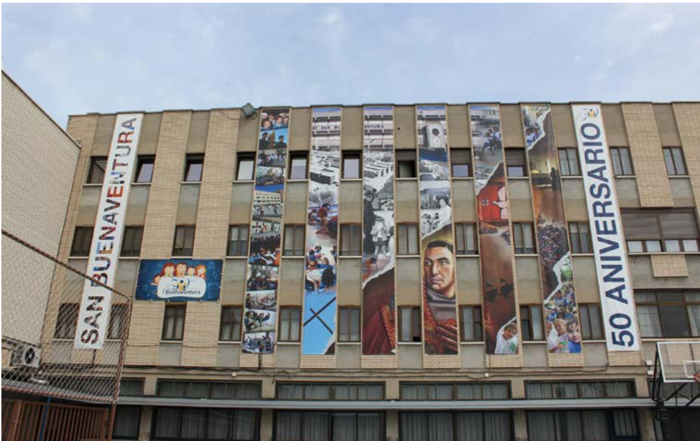
"Colegio San Buenaventura"