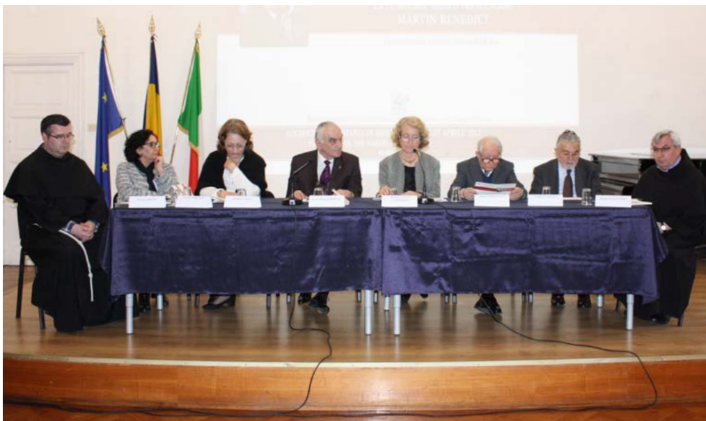
The chairman’s table