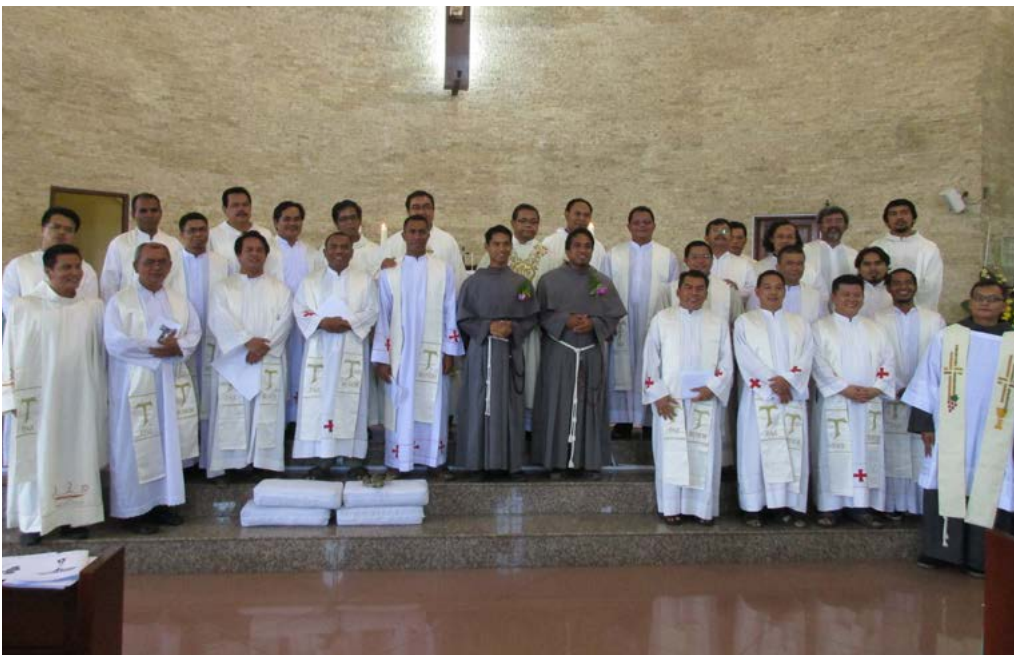
The newly professed with the confrères

After Mass, the party continued with fraternal recreation and lunch.