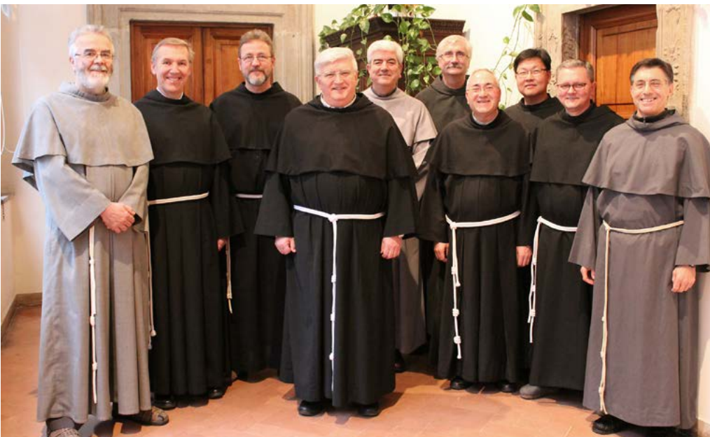
The General Definitory