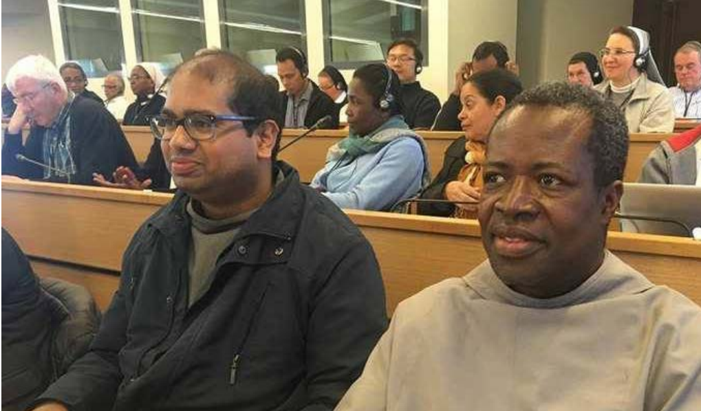
Among the participants

Further information can be found on the website: www.sedosmission.org (Service of Documentation and Study on Global Mission. This forum is open to Institutes of Consecrated Life desiring to deepen their understanding of mission in a global context).