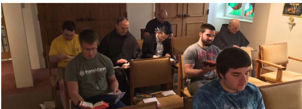
With the friars in Chicago