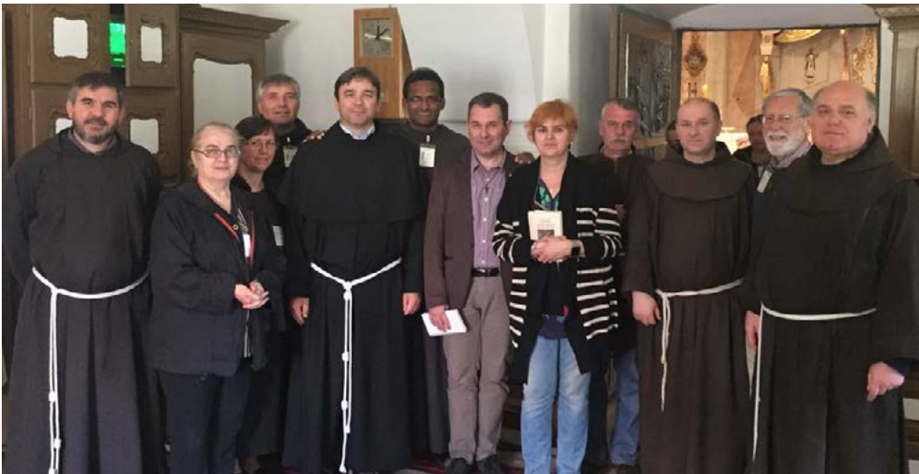
The new National Council