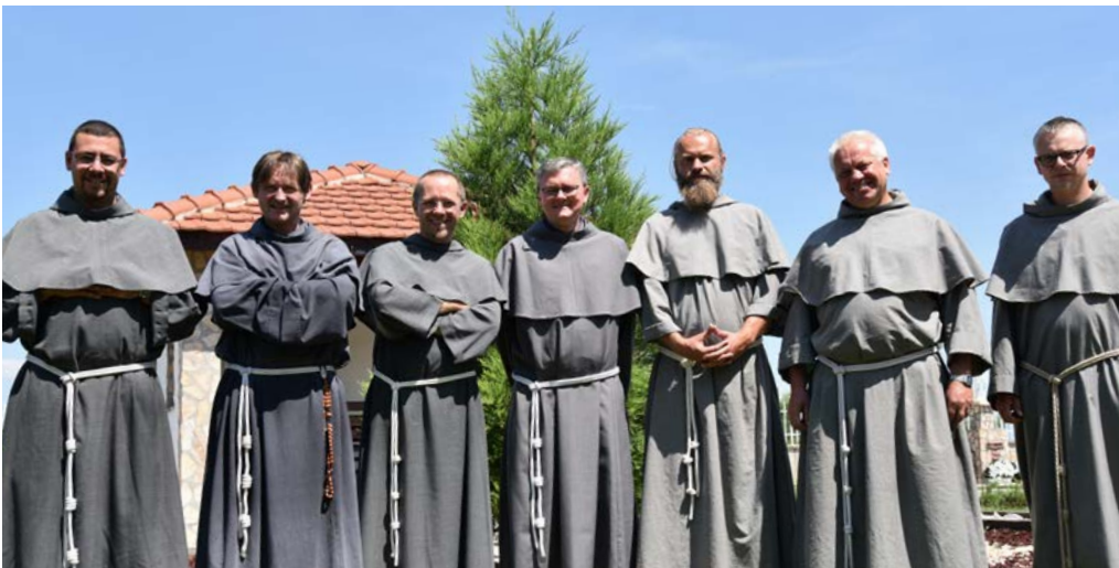
With the friars of the Delegation

Let us pray for these friars and for the Church of Bulgaria so that, filled with the Holy Spirit, they may carry out their mission in the service of God's holy people.