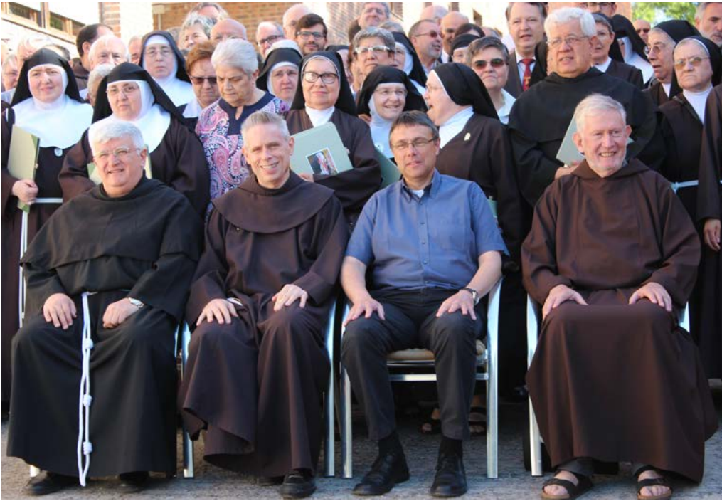
The Ministers General of the OFM Conv., OFM, OFS, and OFM Cap., among the participants

The results of the work of the Congress have been synthesized in “The Madrid Declaration”, a document which notes how times of misunderstanding and rivalry have now been overcome and how it is time to heal all wounds: “With the charismatic novelty denoted in our unique Franciscan fraternity, we are called by ‘new times to a new fraternity’. At this point it makes no sense to stay bound to our local or family problems: equalities/inequalities, inclusion/exclusion, dignity/unworthiness...With creativity and fidelity to the charism, now is the time to take a chance on a project that is part of our Gospel heritage: ‘So that they may all be one’ (John 17:21).