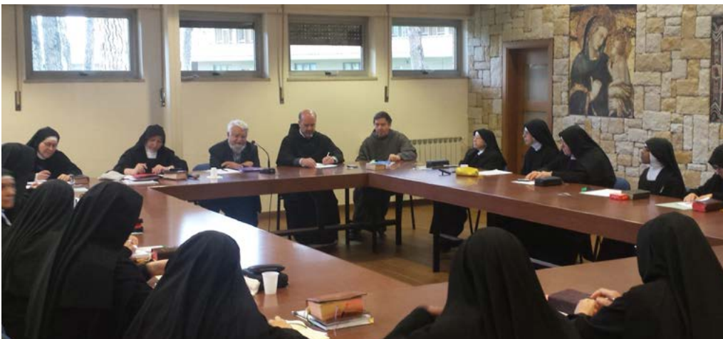
During the session