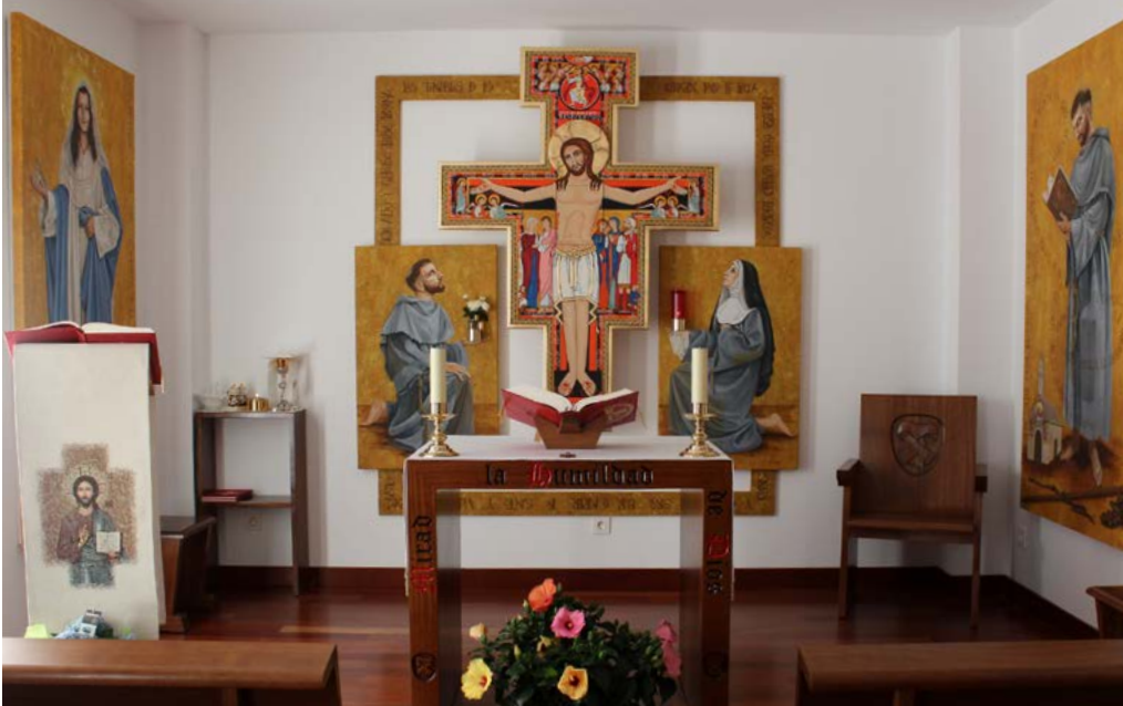
The chapel of the new formation house

The event concluded with a fraternal lunch in the friary, prepared by the fraternity itself. The fraternity consists of six solemnly professed friars, one temporarily professed friar and a second-year postulant.