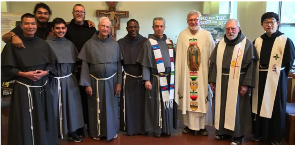
with the friars in San Antonio

He gave two presentations at each formation house in order to raise awareness about today's missions and to encourage participation in them: The first presentation, was on Franciscan missionary spirituality and how it opens up new horizons for missions in our Order, especially in Asia and French-speaking Africa. The second, presented testimony about the foundation of the mission in Peru and the process that led to the martyrdom of Blessed Miguel TOMASZEK and Blessed Zbigniew STRZAŁKOWSKI.