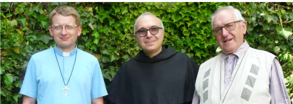
With the representatives of the M.I.