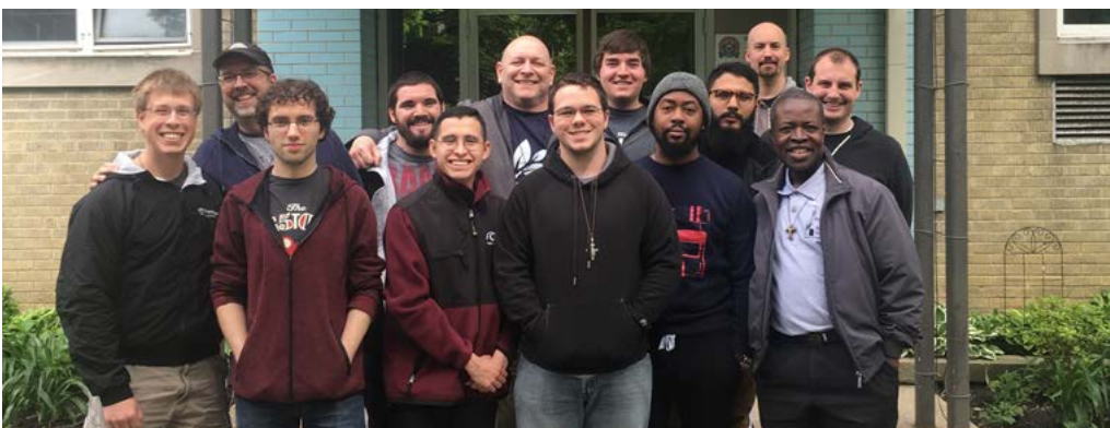
Among the postulants