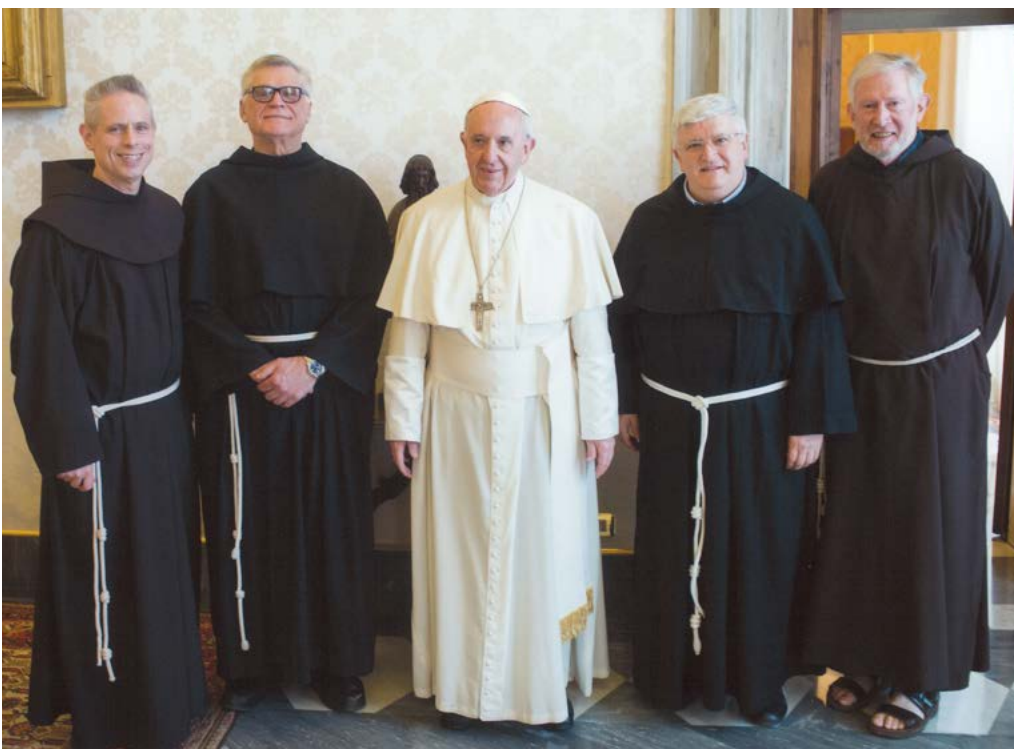
Ministers General of the OFM, TOR, OFM Conv., and OFM Cap. with Pope Francis

Finally, they asked Pope Francis to grant a special audience to all the friars who will go to Rome on the anniversary of the approval of our Rule, November 29, 2017.