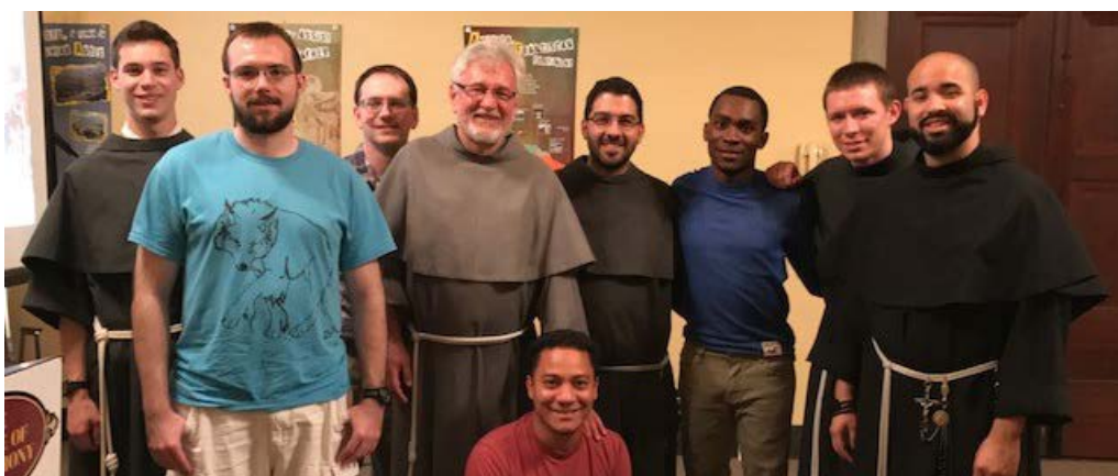
With the friars in Silver Spring