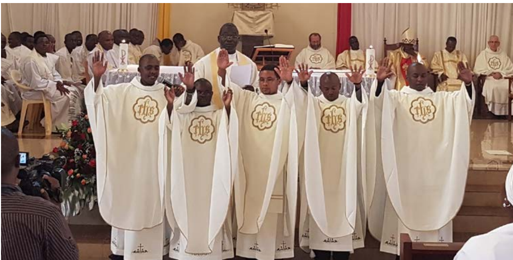
Newly ordained priests give their blessing