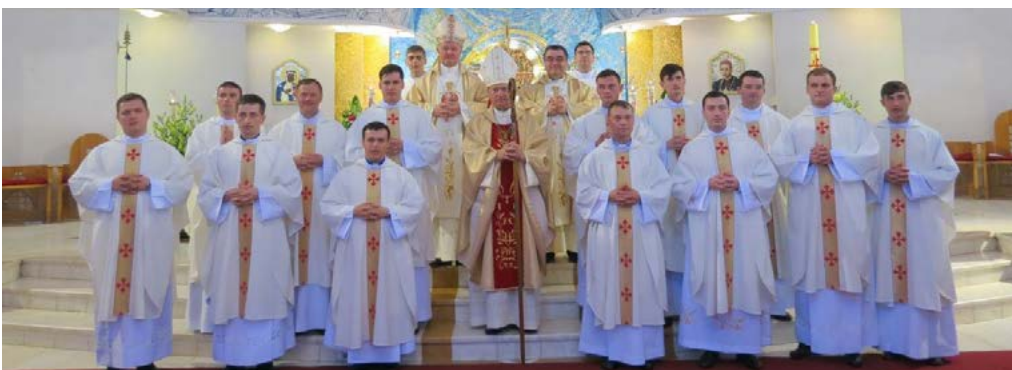
The newly ordained priests

Next Sunday, the new priests will celebrate their first masses in their places of origin.