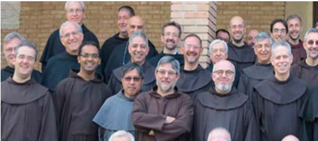
The participants (partial)