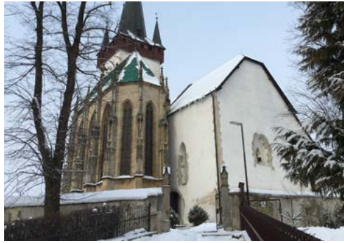
The friaries in Levoča and Spišský Štvrtok

Currently, the Custody has seventeen solemnly professed friars and two temporarily professed. The Custody has four friaries located in Bratislava, Spišský Štvrtok, Levoča and Brehov. The friars serve at three parishes, a Catholic school, a recovery center and a retreat house. Two friars work in Italy—one at the Vatican Apostolic Penitentiary and the other in the Italian Province of St. Francis of Assisi (Central Italy). The Custody will celebrate its Chapter next year.