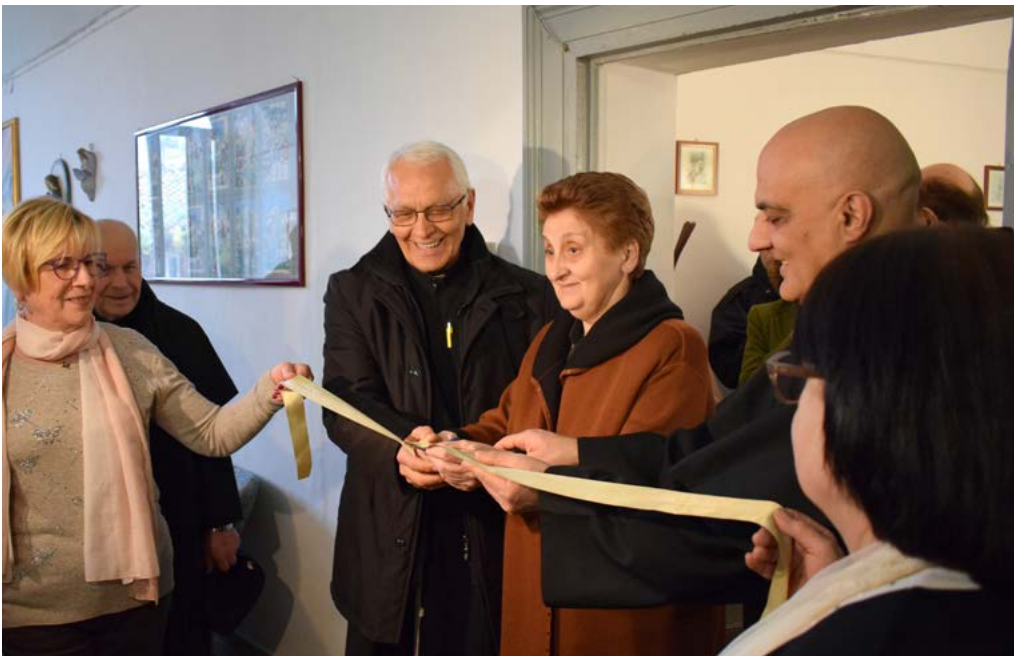
Inauguration of the “Dads’ House”

The inauguration took place after a break-in period which began last September. Since then, 120 fathers have already been hosted. One came from as far away as Afghanistan, but others have come from Greece, Libya, Albania and Southern Italy.