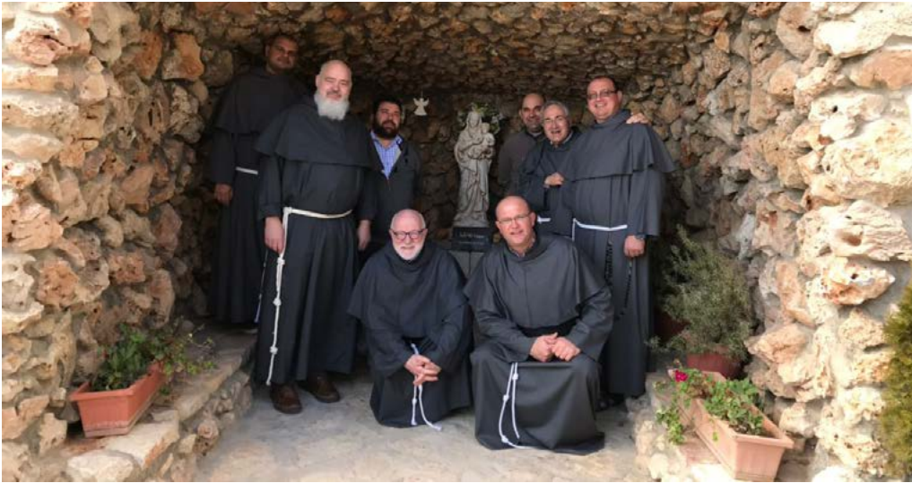
Some friars of the Custody

for the faithful participating in Easter and Franciscan events (the Palm Sunday procession, Good Friday and the Pardon of Assisi indulgence).