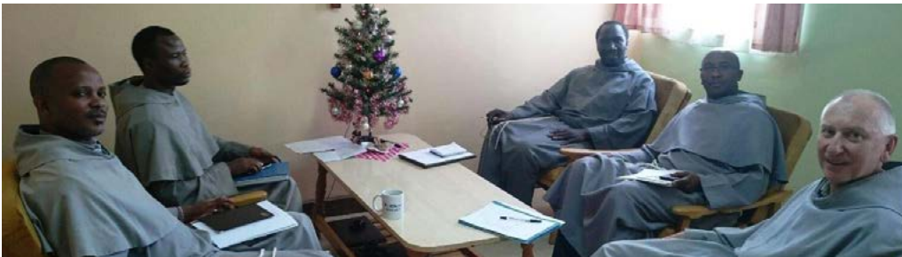
The Definitory of the Custody in Kenya