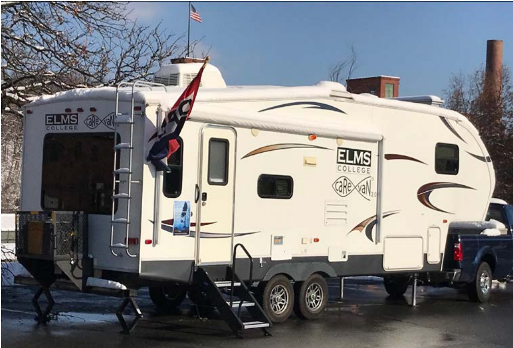
The “caRe vaN”.

The symbol chosen to represent this ministry is “caRe vaN.” These words are enclosed with an ICTHUS, a fish symbol which represents Christ. The students chose an unusual capitalization with R and N in large letters because those two letters stand for ‘Registered Nurse’ and the van is run by nursing volunteers.