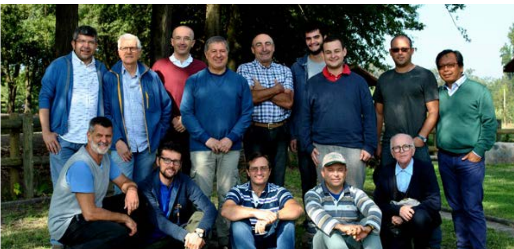
The friars of the Delegation

On Friday, March 9, after Vespers and the Way of the Cross prepared by those in formation, the friars returned to their community, feeling renewed and ready to live a new way of life.