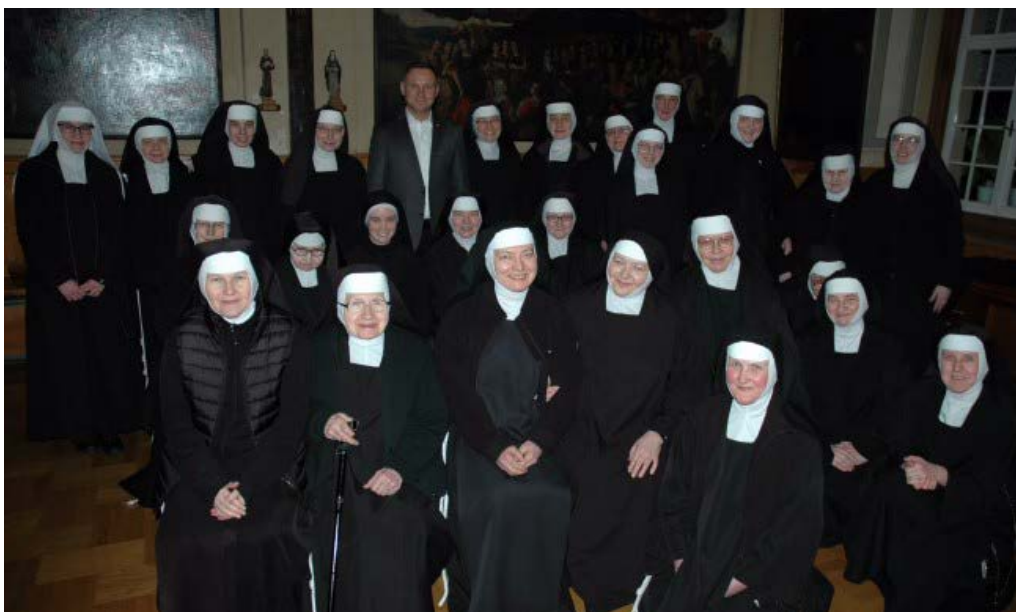
The President of Poland with the Poor Clares of Cracow

The President's visit provided an opportunity for conversing, asking questions, taking pictures, and above all, praying for the country in front of the relics of Blessed Salomea. She became Poland's first Poor Clare during the time of the Piast dynasty.