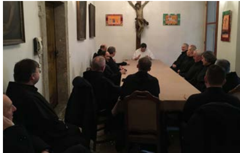
The church in Opava and the community in Prague