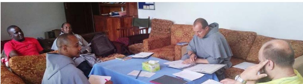
The Definitory of the Custody in Tanzania