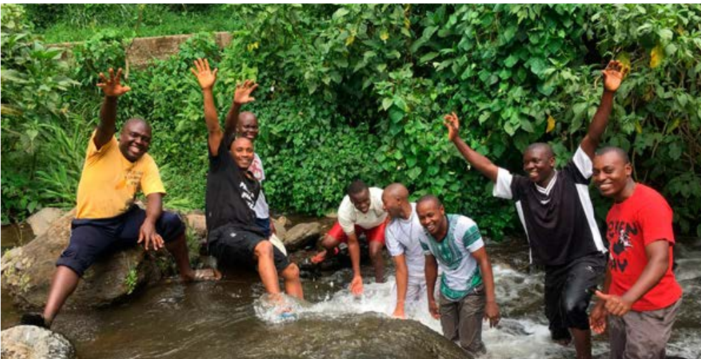
The novices during the outing

The St. Anthony of Padua novitiate and friary at Arusha is situated on twenty-four square acres of land, located at the foot of Mount Meru, the third highest mountain in Africa. The western border of the novitiate property is flanked by a beautiful river which springs from the mountain. Upon entering the novitiate, practically everything indicates that the friars are real sons of St. Francis, the Patron Saint of Ecology. There are big forest