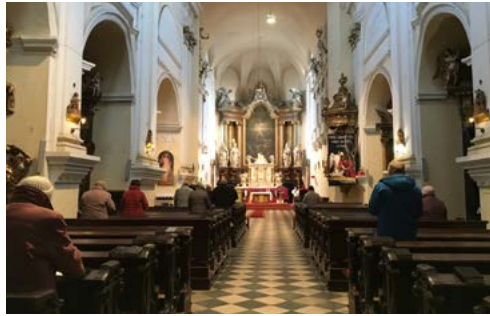
The churches in Jihlava and Krnov-Cvilin