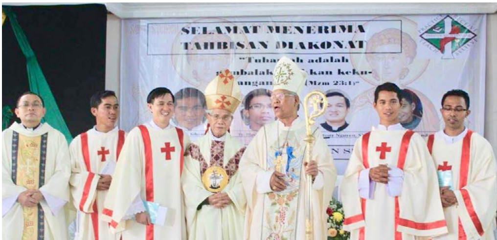
After the Mass