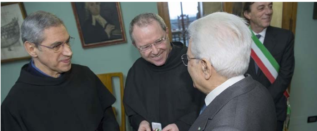
The Italian President with the friars of the Basilica of St. Anthony of Padua