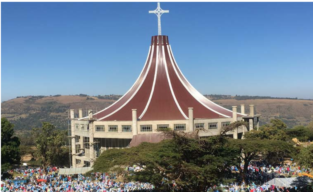
The shrine in Subukia

On Tuesday, February 1, the Delegate General met with the fifty-two student friars after supper. Although the seminar lasted an hour and forty-five minutes, it was not long enough to exhaust the topic. After discovering that only a few friars had thoroughly read Laudato si' the Delegate General spent more time to introducing the encyclical. He pointed out that the encyclical is the Pope's thesis on the environment. According to the Delegate General the overall assertion of the social encyclical is this: "Should the pace of modern development continue as it is and nothing is done to repair the damage of