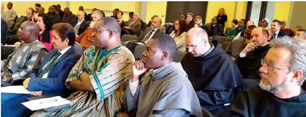
In the lecture room