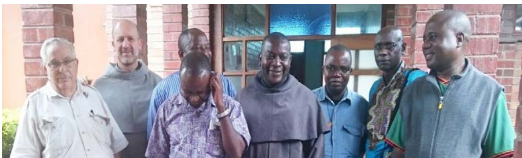
The Definitory of the Province in Zambia