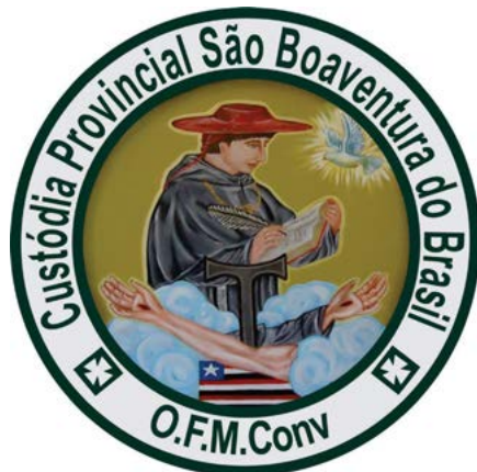
The logo of the Custody