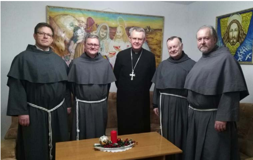
The friars of the mission with the FEMO Assistant General and the local bishop