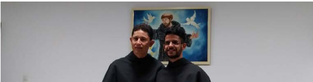
The newly professed