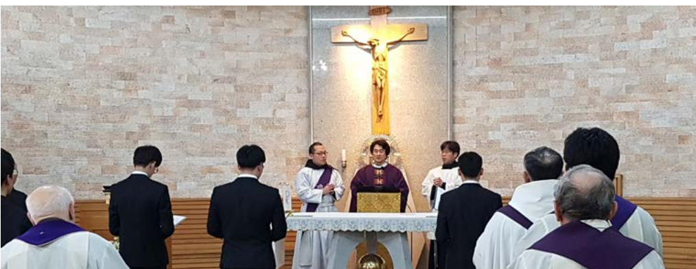
During the Mass

The Assembly ended with Mass presided over by the Minister Provincial.