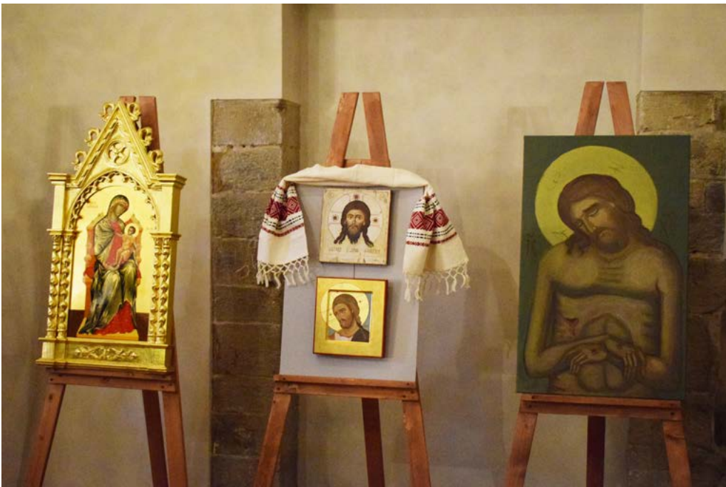
Some works of the exhibition