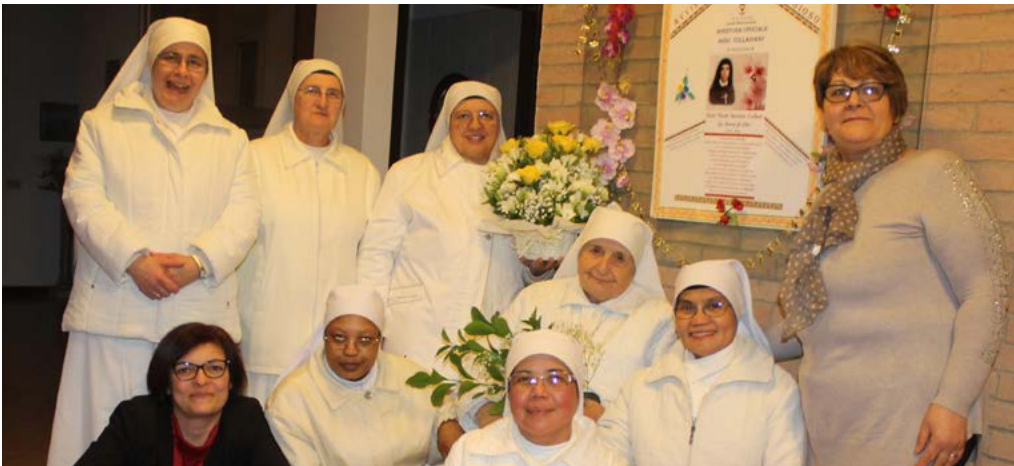
Sisters of the Institute of Merciful Sisters together with some lay faithful