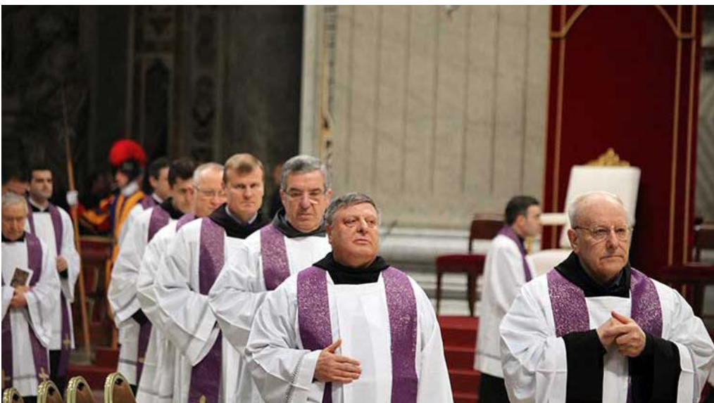
Some of our friar confessors

Prior to the evening celebration in the Basilica, the Pope held a midday meeting in the Paul VI Hall with the members of the Apostolic Penitentiary and the participants in the course on the internal forum for confessors. This course is organized by the Apostolic Penitentiary every year.