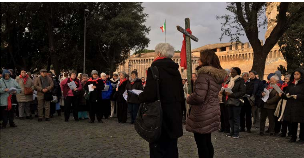
Stations of the Cross on the streets of Rome

Reflecting on martyrdom leads us to Jesus, the culmination of God’s history of love and care for humanity. Therefore, commemorating the martyrs means opening one’s heart and eyes for a more humane future, for a Church that increasingly conforms to the spirit of the Gospel.