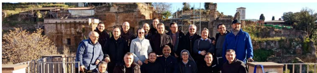
The vocation animators