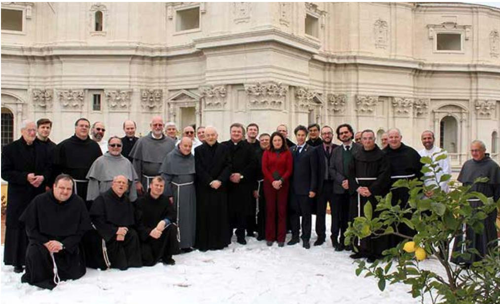
The participants on the friar's roof terrace