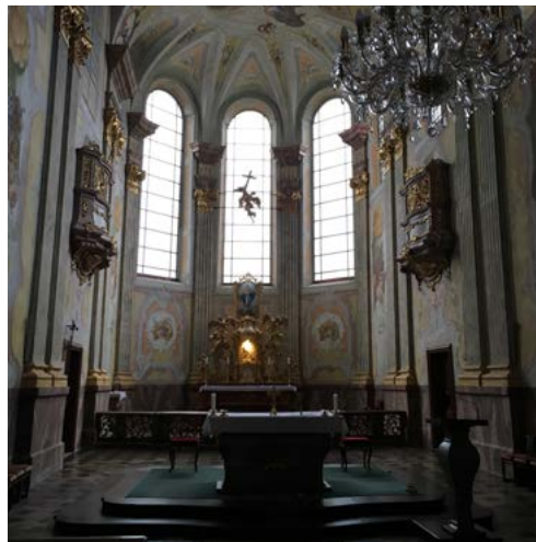
The churches in Brno and Krnov