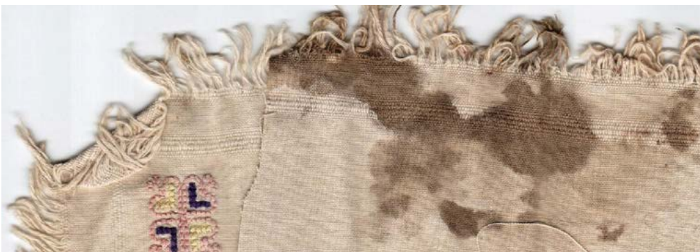
A piece of cloth with the martyr's blood