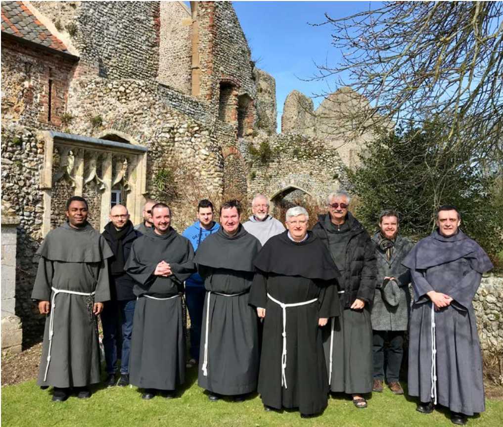
The friars with the Minister General

There is both a Catholic and an Anglican worship site in Walsingham. It is hoped Walsingham will serve as a center for ecumenical dialogue under the guidance of Our Lady.