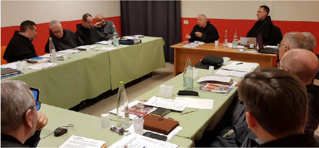
In the lecture room.

Some of the more important topics discussed included an examination of the FIMP document on vocational discernment and the criteria for entry into the postulancy program; the direction of the Missionary Center, animation in the field of Justice, Peace and Integrity of Creation; planning for the College of Pastors; an evaluation on the progress of all the initial formation communities and finally, the national level assistance provided by the Militia of the Immaculate (M.I.) in Italy.