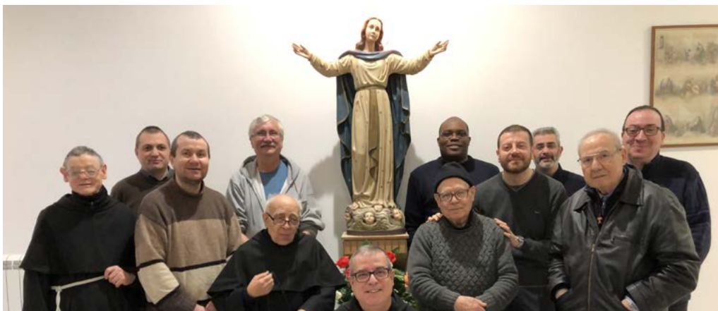
Some friars of the Province

It was one of the initiatives organized by the Province Formation Commission in the first year of the new Province. The retreat took place in response to the Four-Year Plan of the Province (PPQ) to make the friars' relationship with God their prime concern during the year. The Province will hold an Extraordinary Chapter and a Provincial Assembly in June of this year.