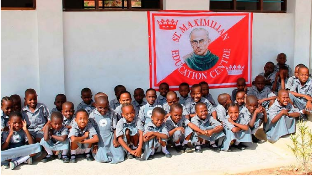
Children of the Center

The Center's motto is: "Education That Adds Value", which means that the Center's purpose is to educate the whole person: spiritually, intellectually, socially and morally. The Center's teachers understand the importance of having a curriculum that embraces the needs, abilities and interests of the students. In short, the main purpose of the St. Maximilian Education Center is to raise the standard of living of the Tanzanian popula-