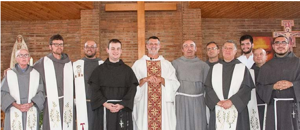
After the Mass

After the liturgical celebration, there was a fraternal agape meal in the courtyard of the parish church. The celebration was a testimony of life and faith for all those present, especially for the young people. May the Lord continue to bless our Delegation through the prayers of our Seraphic Father, St. Francis of Assisi and through the intercession of the "Virgen del Carmen", our Mother and Patroness of Chile.