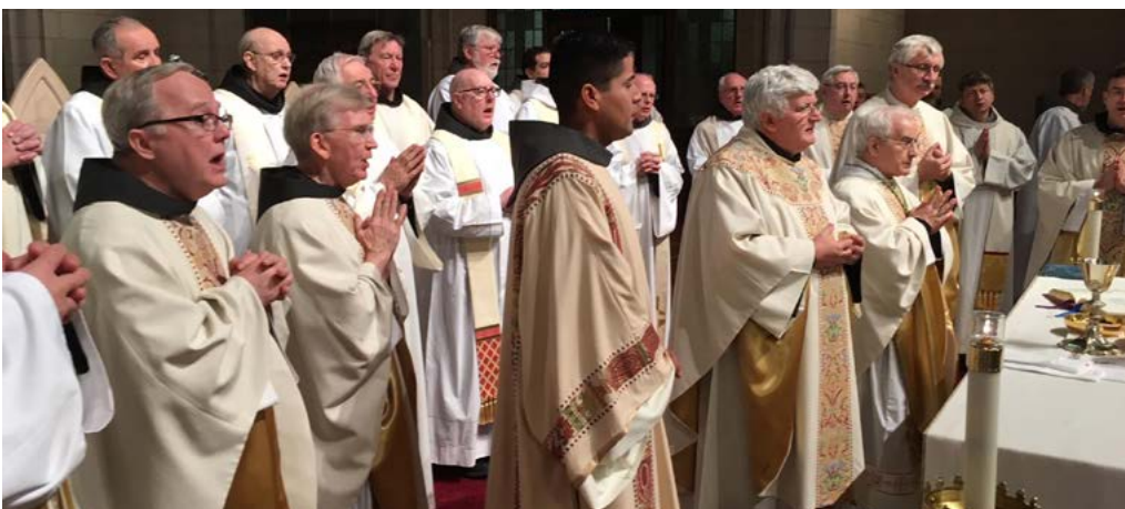
During the Mass