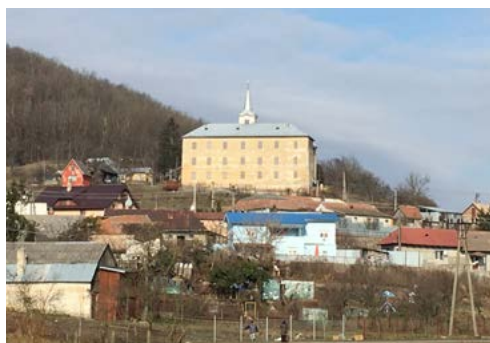
The friaries in Bratislava and Brehov