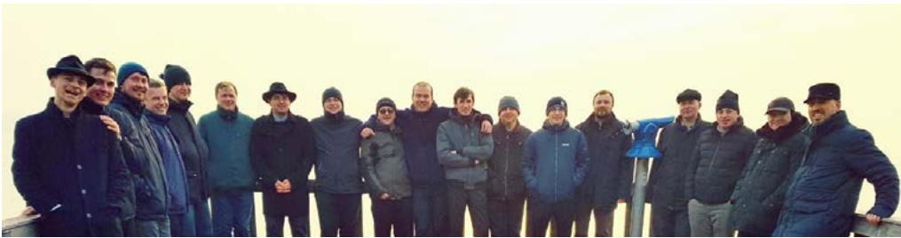
The Romanian friars

The meeting concluded with a walk near Lake Chiemsee followed by a fraternal dinner.