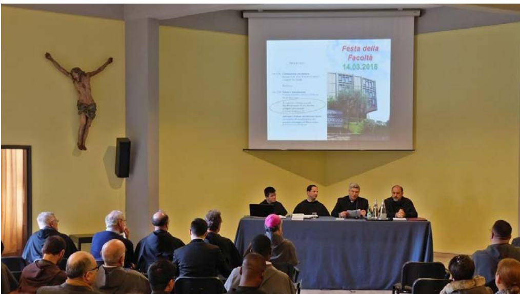
In the lecture room